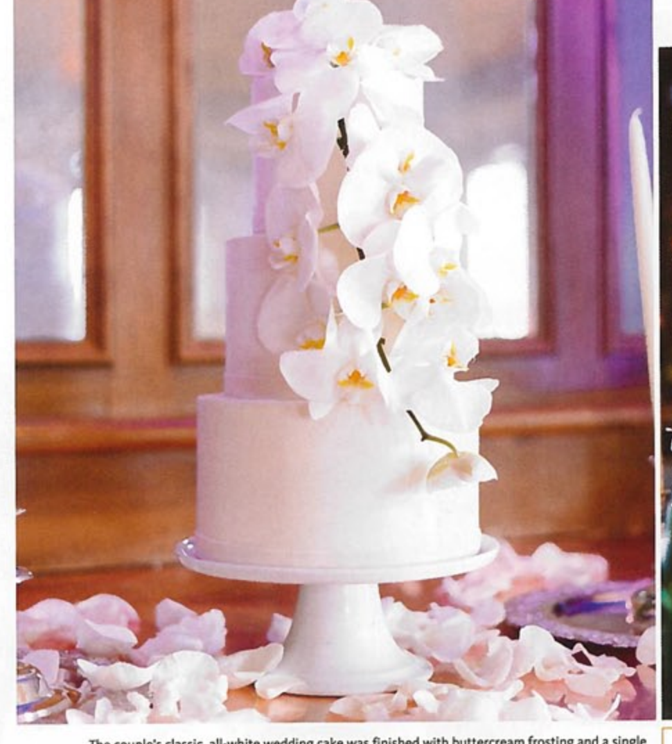
The couple's classic, all-white wedding cake was finished with buttercream frosting and a single cascade of orchids. Once the night came to a close, the newlyweds made their postreception getaway down the mountain in a private gondola with the sound of alphorns in the background.