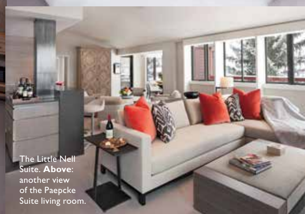
The Little Nell Suite. Above: another view of the Paepcke Suite living room.