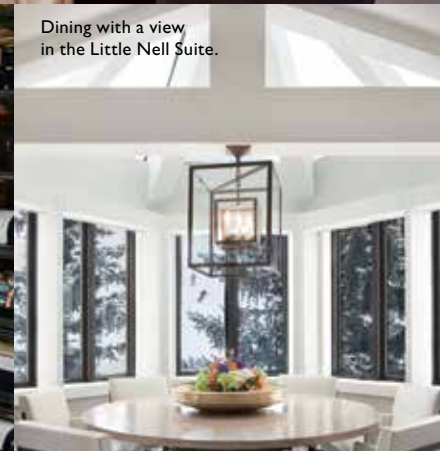
Dining with a view in the Little Nell Suite.