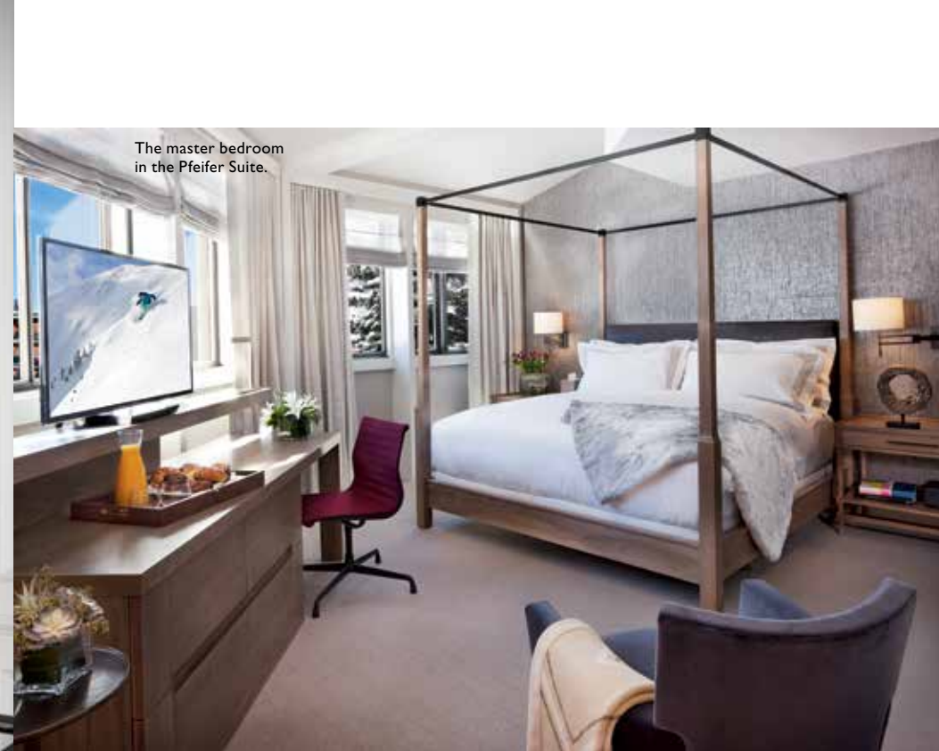
The master bedroom in the Pfeifer Suite.