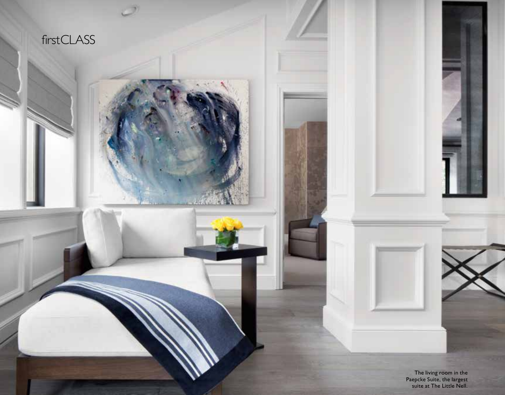
The living room in the Paepcke Suite, the largest suite at The Little Nell.