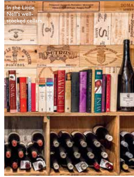
In the Little Nell's well-stocked cellars.