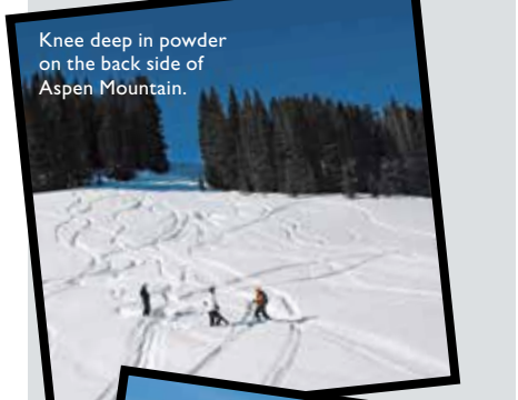
Knee deep in powder on the back side of Aspen Mountain.

Making TRACKS Little Nell's Powder Cat takes you to Aspen's remote back country for a day of skiing fresh powder, followed by lunch at its intimate mountain cabin.